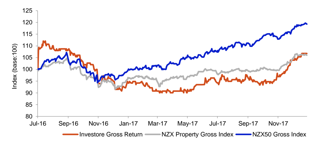
Figure 3: Investore Total Shareholder Return Relative to NZX Property Gross Index (Rebased to 100)

Figure 3 summarises Investore's share price performance for the period between listing (12 July 2016) and 8 January 2018, relative to the NZX Property Gross Index and NZX50 Gross Index (all inclusive of dividends). The property sector as a whole has underperformed the broader market during this period, and while Investore has underperformed the sector over most of this period, it has recently closed the gap. Investore's 8.1% value uplift on its first day of trading was not maintained, with its share price decline since IPO offsetting dividend returns. However a recent rally in Investore's share price has resulted in a 6.8% total shareholder return since listing, compared to a 6.1% total return for the NZX Property Gross Index and 19.3% for the NZX50 Gross Index over the same period.