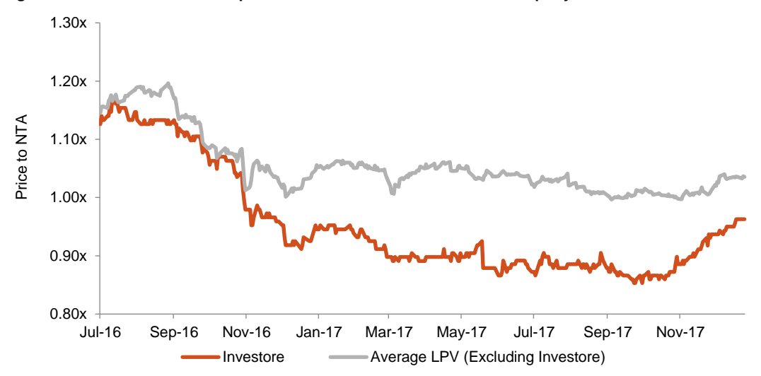
Figure 1: Historical Price to NTA performance for Investore and Listed Property Sector